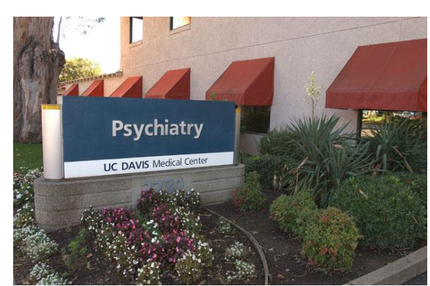
UC Davis Medical Center, Dept. of Psychiatry and Behavioral Sciences