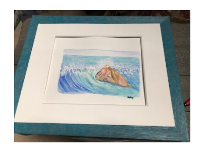
Submitted by Betsy Sheldon 3