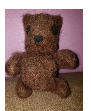
Submitted by Shelli Singleton