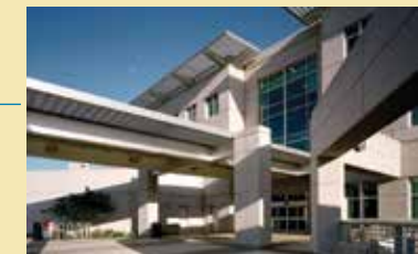
Lawrence J. Ellison Ambulatory Care Center