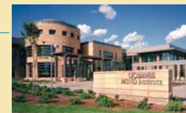
UC Davis MIND Institute