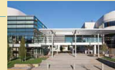
UC Davis Comprehensive Cancer Center