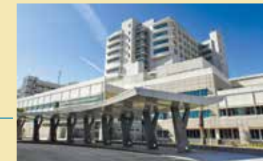
UC Davis Medical Center and Children's Hospital