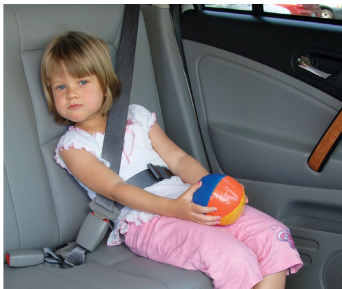
No booster— WRONG seat belt fit

The booster seat lifts the child up to help the lap belt fit properly, low and snug across the hips. The booster seat also helps the shoulder belt to fit right, which is snugly across the mid chest and resting on the shoulder.