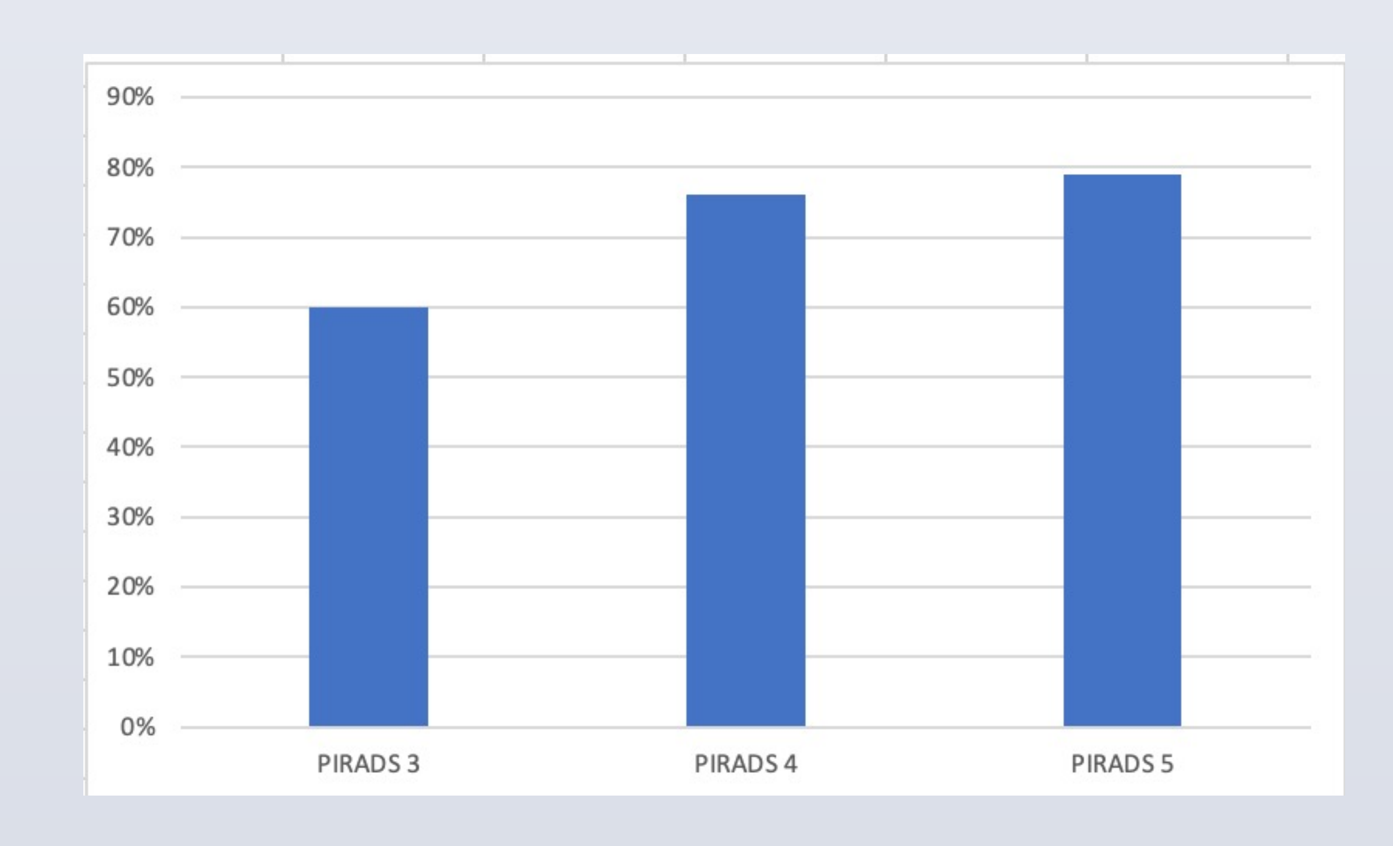
(Figure 1) Percentage of Highest-Grade Lesions that were On-Target, Stratified a Certain PIRADS Score