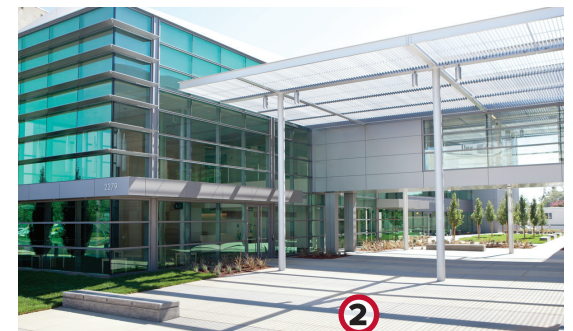
Main entrance on 45th Street