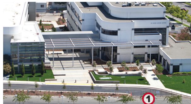
Patient drop off at circle drive on 45th Street