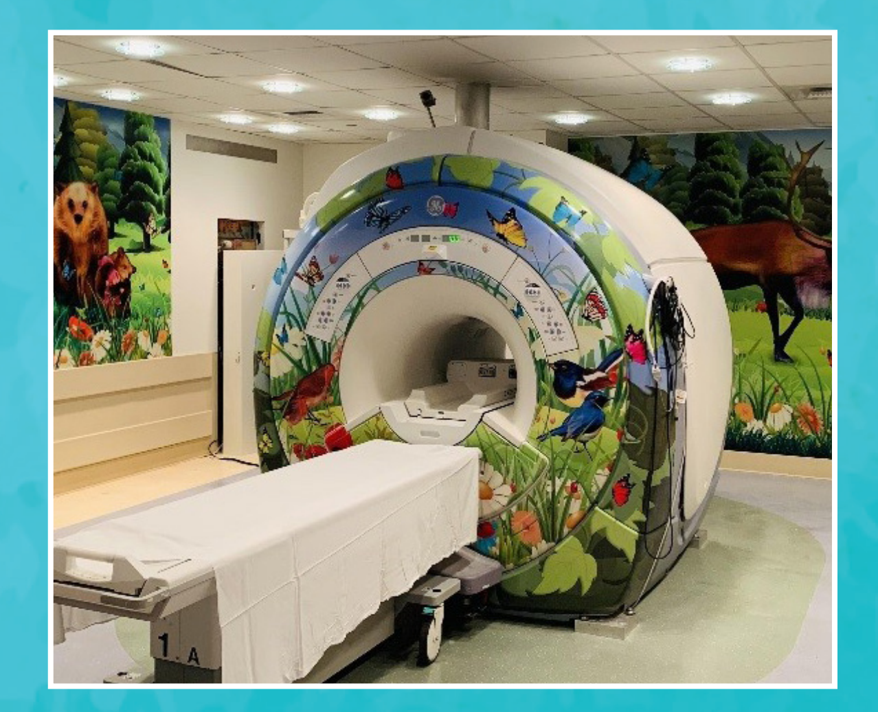
Child-friendly décor and movie goggles make for a stress-free experience during MRI scans

State-of-the-art children's surgery center, specifically designed for the unique needs of children