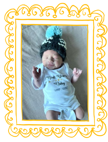
Meet our first baby born in 2023!

CalMedForce is funded by Proposition 56, which allocates $40 million of funding toward Graduate Medical Education (GME) to sustain, retain, and expand California residency positions in primary care and emergency medicine. The University of California (UC) is the designated recipient of funds and contracts with Physicians for a Healthy California (PHC) to administer the GME grant program, CalMedForce.