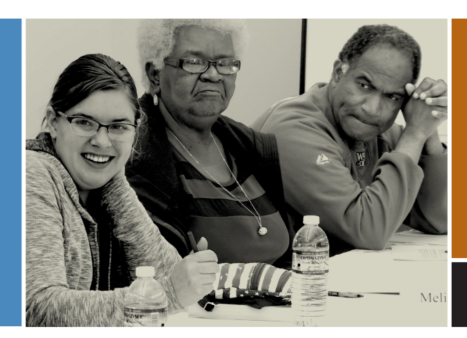
"It seemed to me like they already get enough incentives and bonuses down the line, I actually want them to do something because it's the right thing to do."

Rewarding physicians for appropriate medical care was an option in both the antibiotics and C-sections scenarios. It was soundly rejected: within both scenarios, only 4% of participants chose this as a worthwhile option. Those that supported it believed that physicians are no different than others who are motivated by financial recognition. Yet the vast majority opposed it vehemently. Since participants saw medicine as a highly-esteemed and well-compensated profession, they believe that physicians should be motivated solely by their responsibility to "do the right thing."