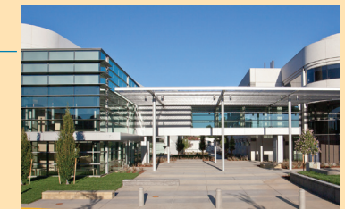
UC Davis Comprehensive Cancer Center