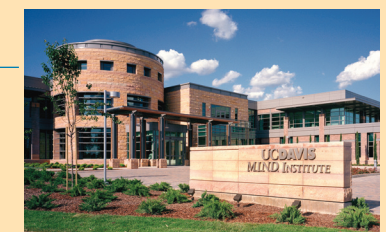
UC Davis MIND Institute