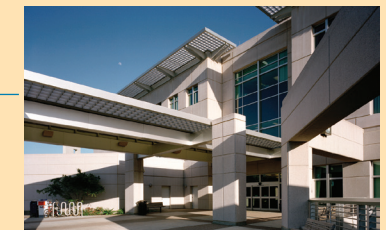
Lawrence J. Ellison Ambulatory Care Center