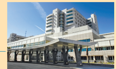
UC Davis Medical Center and Children's Hospital