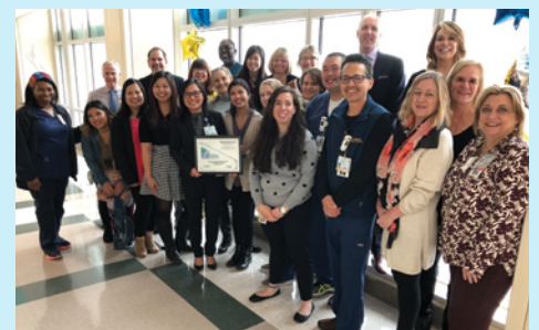
Tower 8 Transplant/Metabolic Unit.