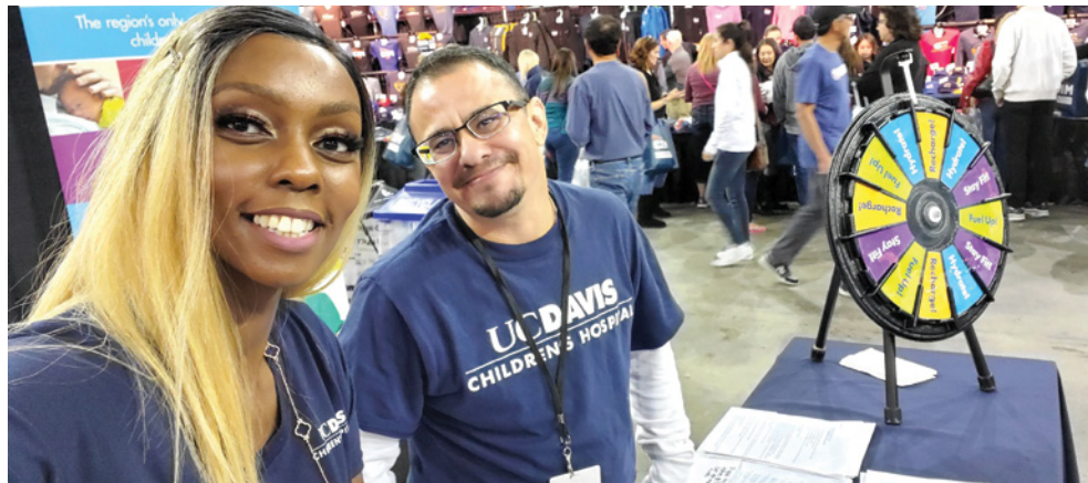
UC Davis Health radiology nurses volunteering at the UC Davis Children's Hospital booth.