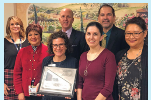
East 5 Neuroscience team.

Over the past two years, five UC Davis Health medical-surgical units have received PRISM Awards, catapulting our medical center to the top spot among California hospitals with five out of six awards.