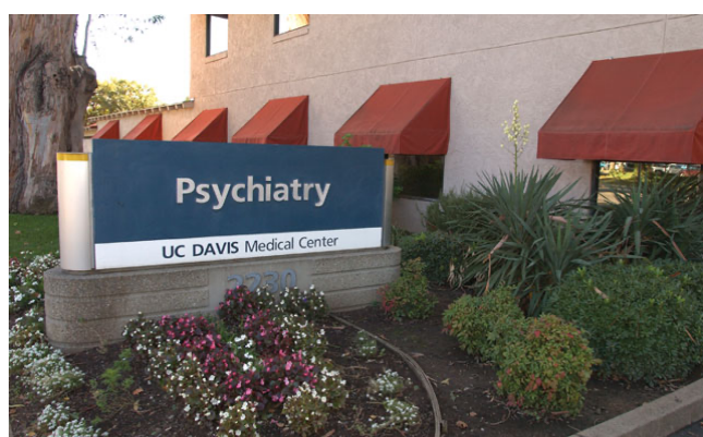
UCD Medical Center, Dept. of Psychiatry and Behavioral Sciences