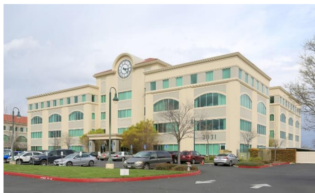
Sacramento County Child and Adolescent Psychiatric Services