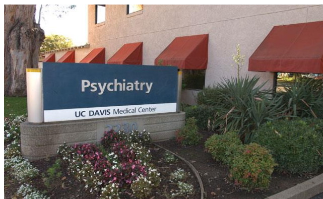
UC Davis Medical Center, Dept. of Psychiatry and Behavioral Sciences