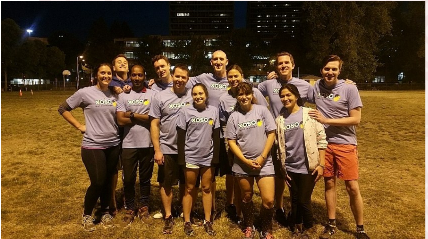
Blue Steel kickball team finished the season a respectable 4-4